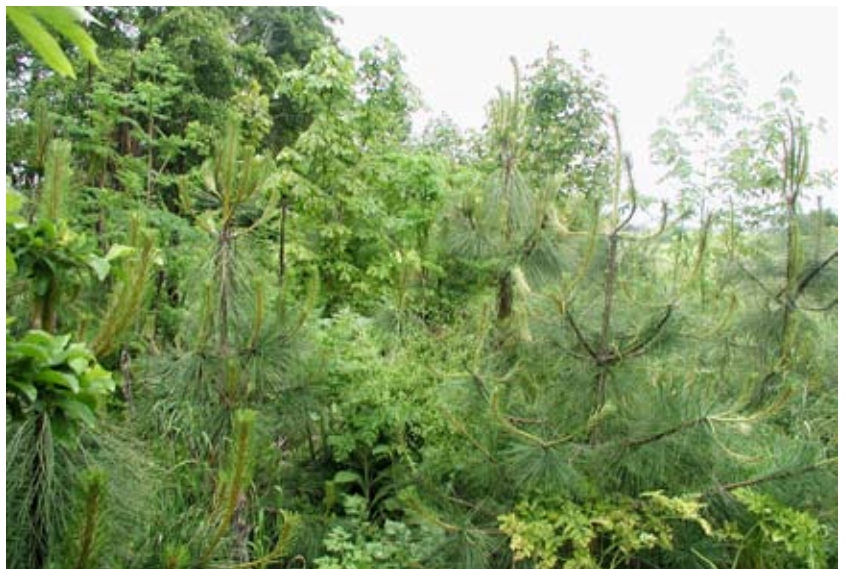
Figures 5, 6, and 7. —An example of replacing Himalayan blackberry with native trees. Site preparation included two mowings and an autumn application of glyphosate, made with a backpack sprayer. Postplanting treatments included spring spot-spraying with glyphosate and hand weeding. At top, the initial mowing, in May 2000. The Himalayan blackberry thicket was 4 to 8 feet tall on a terrace above Jackson Creek, adjacent to a farm field. Figure 6, center, is the same site in autumn 2001, after the first growing season. Note white alder and Oregon ash in the background. Species planted included ponderosa pine, bigleaf maple, Oregon ash, and Oregon white oak. Himalayan blackberry cover is minimal; competing vegetation is dominated by thistles and poison hemlock. Figure 7, bottom, is the site in spring 2005 from the same photopoint. Trees are well above competing vegetation and capable of dominating the site. Grasses have invaded the plot from the adjacent field; Himalayan blackberry is scarce within the treated area but is invading from the sides (the “edge effect”).