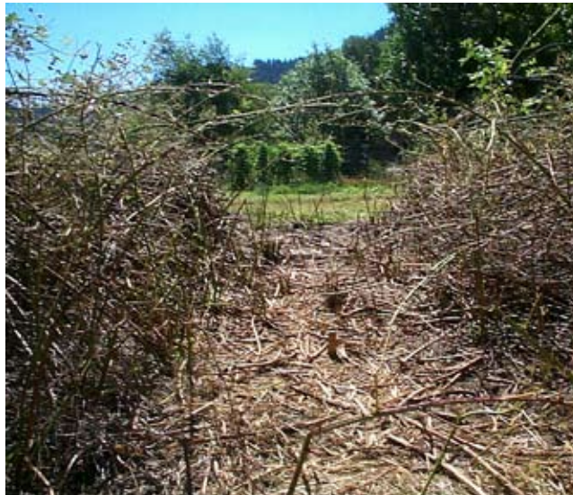
Figure 8. — Goats will eat succulent green leaves and canes of Himalayan blackberry but not dead, woody canes. Blackberry regrows rapidly after the goats leave the site.

Prescribed fire Burn either untreated thickets or mowed or cut areas that have regrown. During spring and summer, blackberry plant moisture content is high. It is lower in late fall and winter and may be easier to burn then. Note that burning permits are required in most localities, and other rules might apply; contact your municipal or county government for information.