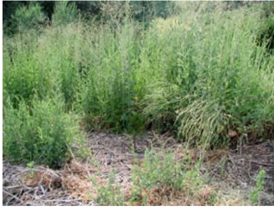
Figure 9.—A dense growth of thistles has invaded this site, initially a 6-foot-tall Himalayan blackberry thicket that was hand slashed and then grubbed to remove root crowns and

goats probably are best suited for Himalayan blackberry control in upland areas when: