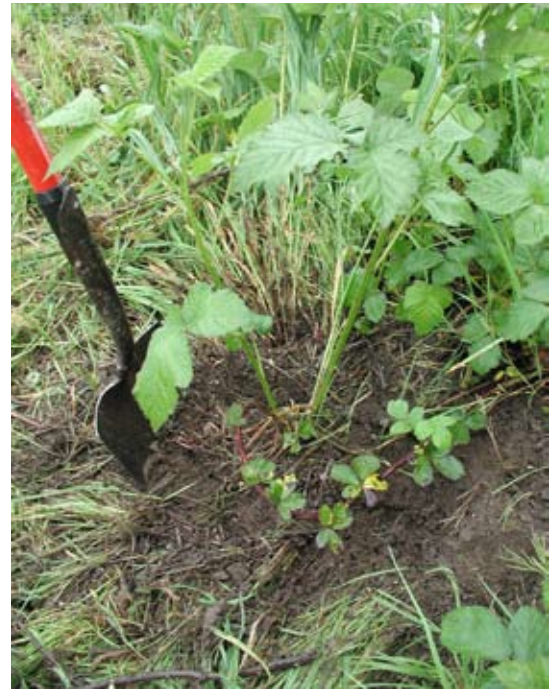
Figure 4.—A new blackberry cane, called a “daughter” plant, can root where another cane’s tip or nodes touch the ground.