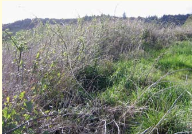
At top left, spores of the blackberry leaf fungus and (top right) the leaf spots that signal infection. Above, blackberry defoliated by the fungus.

on the most rust-resistant plants so they don't spread at the expense of more susceptible varieties. Since new information about the rust is emerging rapidly, riparian practitioners should consult with the Oregon Department of Agriculture or local experts before beginning blackberry control projects in areas where the rust is present.