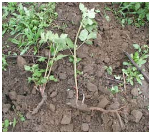
Figure 2 (at far left).—A root crown, or “burl,” of Himalayan blackberry. Many stout lateral roots and smaller, fibrous roots could have emerged from