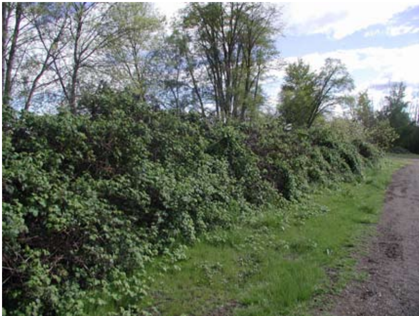
Figure 1.—If the Himalayan blackberry shown here is not checked, it could crowd out the existing trees and prevent new ones from establishing.

Another significant problem with the dominance of Himalayan blackberry is its effect on the development of streamside vegetation over time. Because of the intense competition for light, moisture, and other resources in Himalayan blackberry thickets, few new trees and shrubs can become established. Those that do are mainly root suckers of established plants. As short-lived riparian trees such as alder and black cottonwood die, they will not be replaced with younger trees (Figure 1). Thus many tree-covered riparian zones may be in danger of turning into shrub fields dominated by Himalayan blackberry.