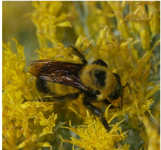
Right – bumble bee on rabbit brush (Vaughan)

The purpose of this technical note is to provide information about establishing, maintaining and enhancing habitat and food resources for native pollinators, particularly for native bees, in Riparian buffers, Windbreaks, Hedgerows, Alley cropping, Field borders, Filter strips, Waterways, Range plantings and other NRCS practices. We welcome your comments for improving any of the content of this publication for future editions. Please contact us!