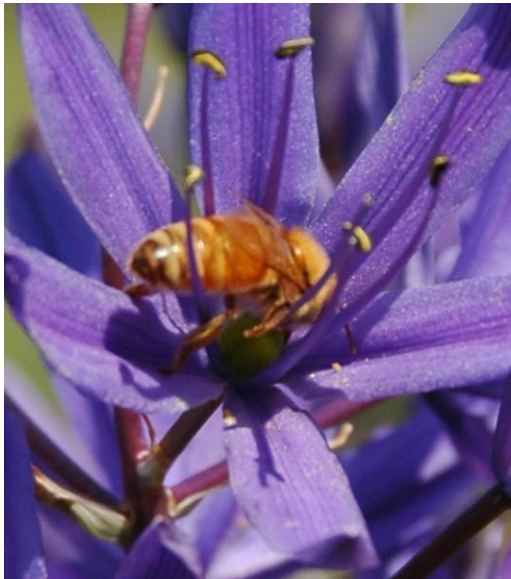
Left – honey bee on camas flower