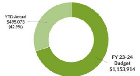
Wages & Benefits Actual vs. Budget