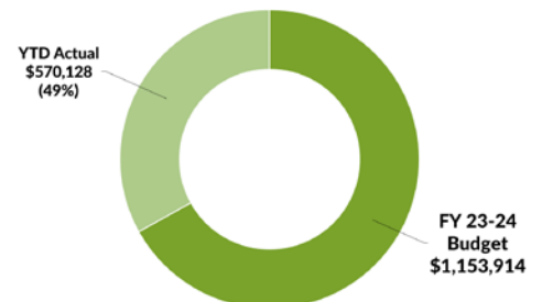
Wages & Benefits Actual vs. Budget